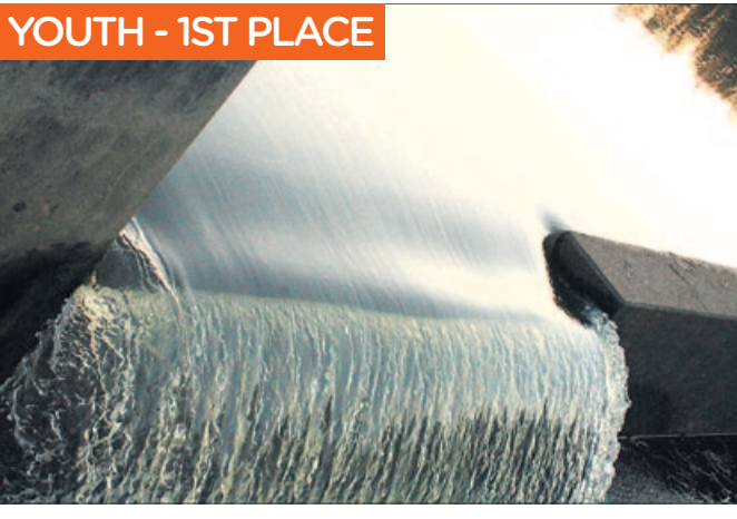
Letisha Hopton with "Overflow"