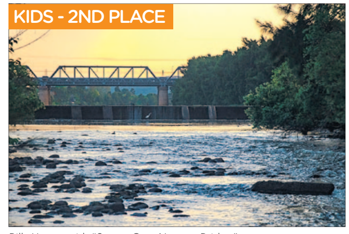
Billy Hutton with "Sunset Over Nepean Bridge"