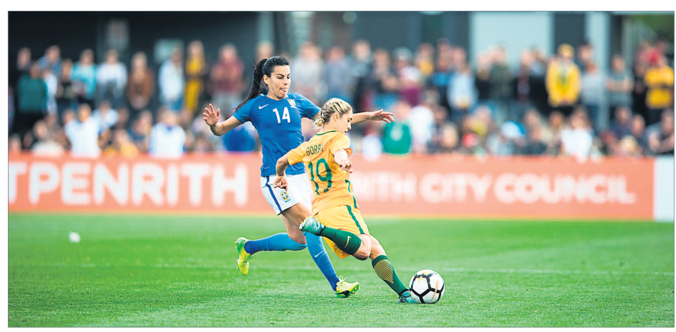
The Westfield Matildas played to a sellout crowd in September, thrilling local fans with a victory over Brazil

Penrith's busy run of world-class events has boosted the local economy by nearly $10 million in recent months, benefitting local businesses including hotels, motels, restaurants, cafes and tourist attractions.