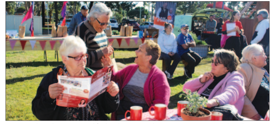
Many residents have reported feeling happier and more active since attending the fortnightly Village Café

The Village Café, held every second Thursday morning at Parklawn Place shops, fosters good health and social connection for local people aged 50 years and over living in North St Marys. It offers an opportunity for older residents to connect with each other and explore new ways of improving their wellbeing as individuals and as a community.