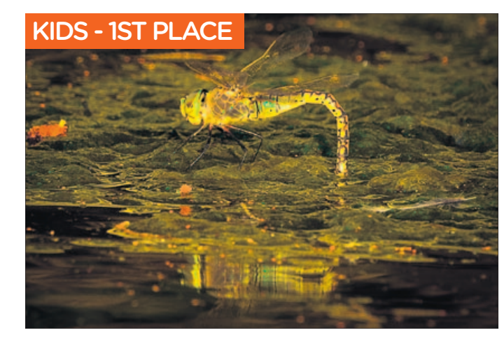
Darcy O'Brien with "Building Nature's Community One Egg at a