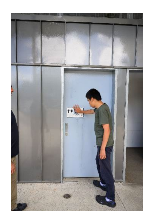
There is also a MLAK accessible toilet.