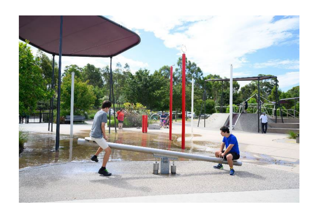
I can try out the seesaw.