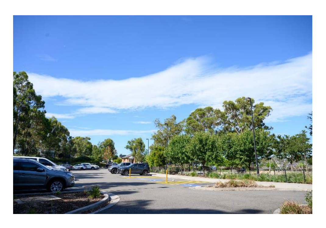
There is a car park next to the playground.