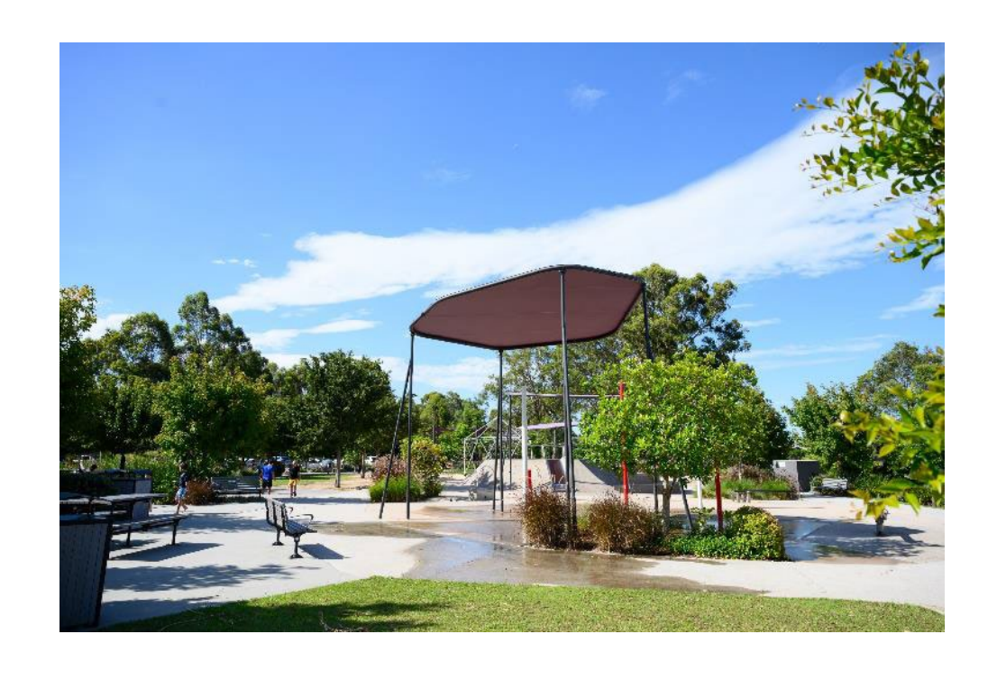
I am visiting Livvi's Place playground.