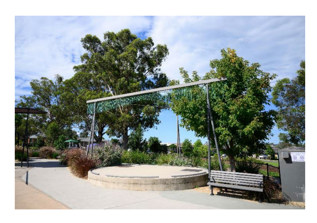
I can perform in the amphitheatre or listen to wind music.