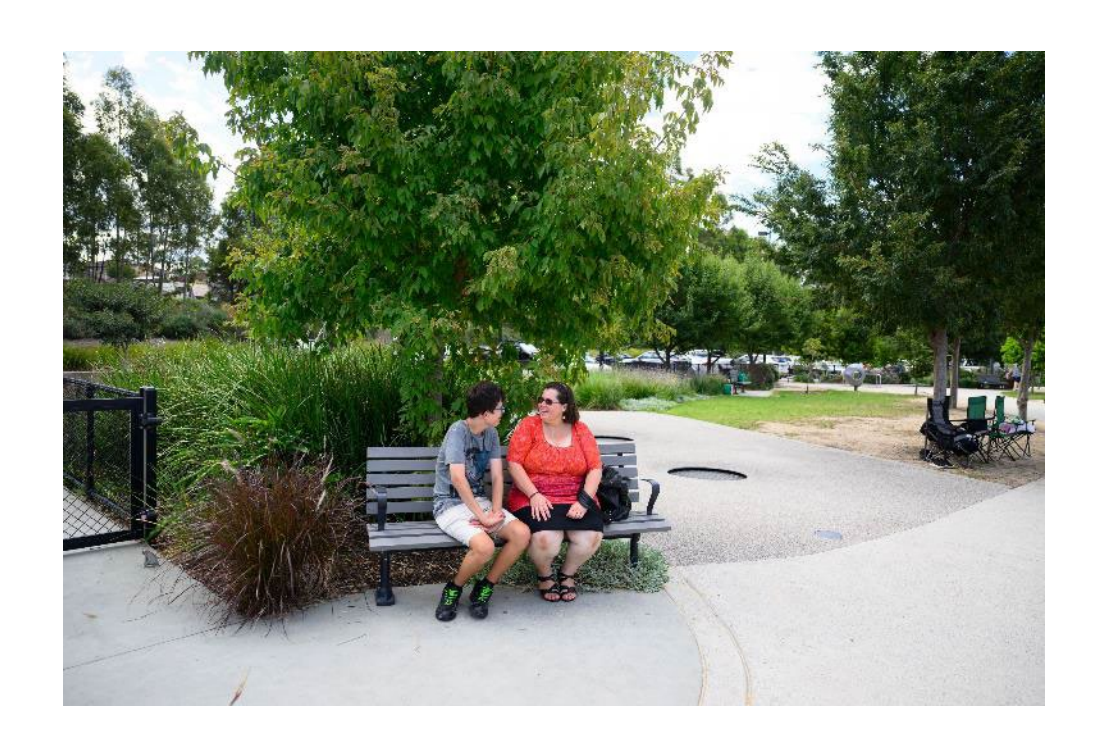
There are benches where I can take a break.