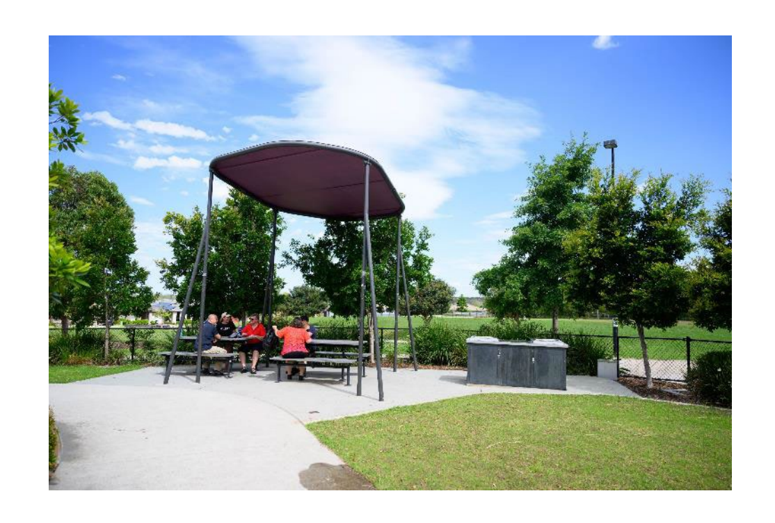
There is a picnic area that I can use.