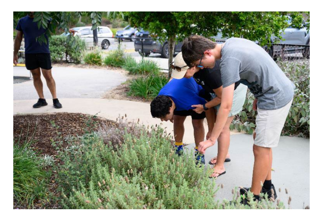
I can explore textures in the sensory corner.