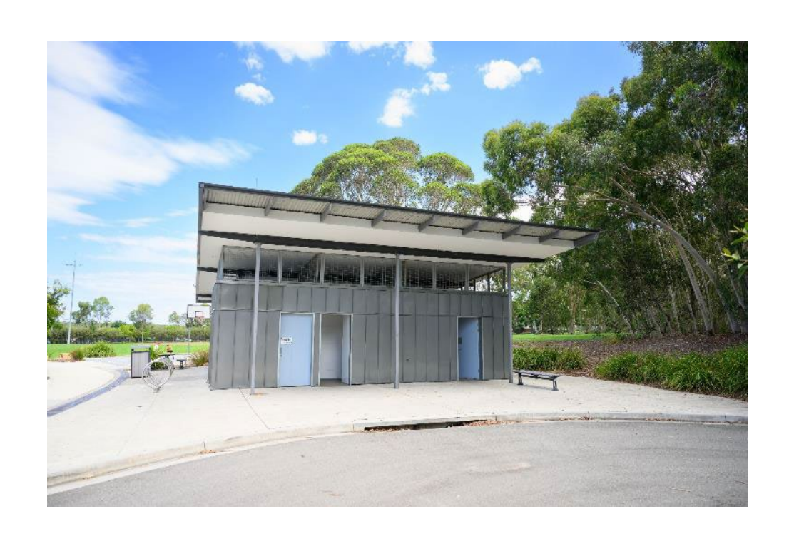
The toilets are next to the playground.