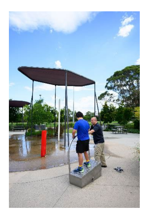
And the balance equipment does the same.