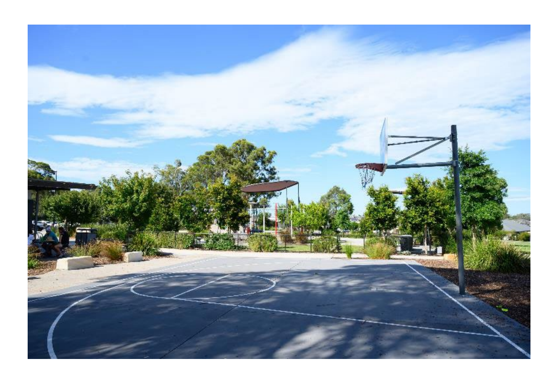
And a basketball court next to the playground.