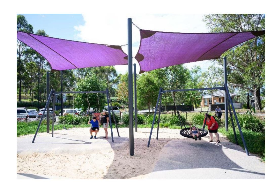
And I can also play with the swings.