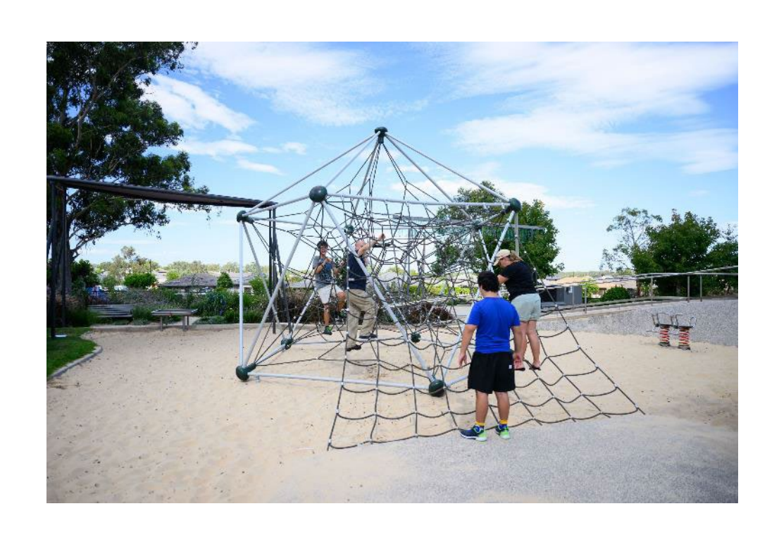
I can play on the climbing frame.