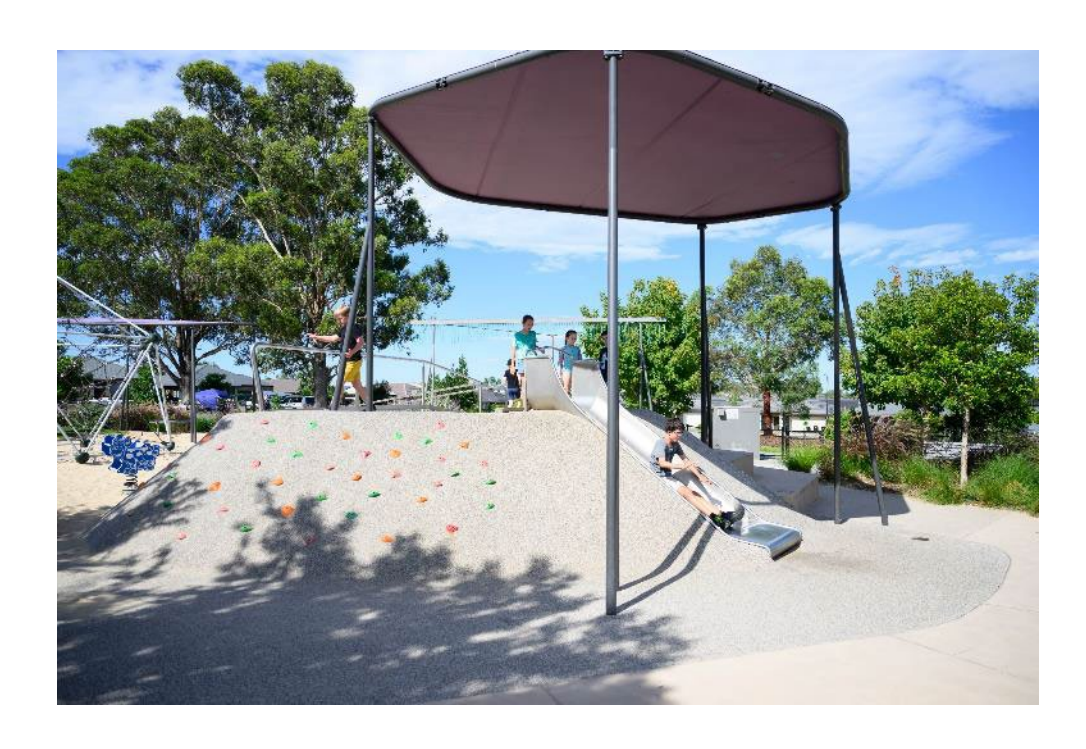
And take turns on the slide.