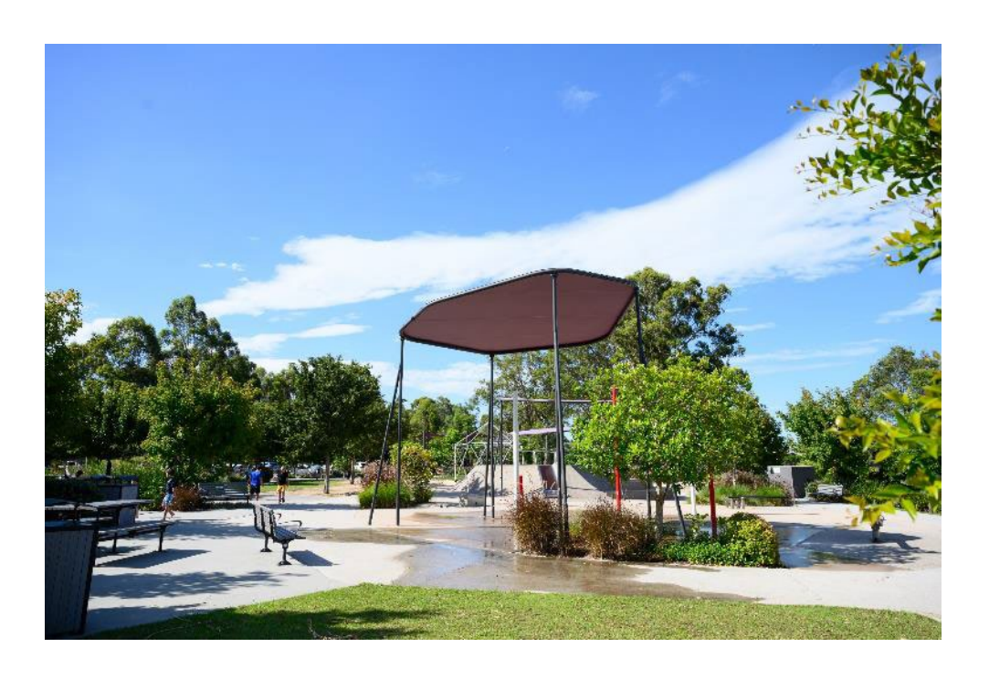
There is a large play area that I can use.