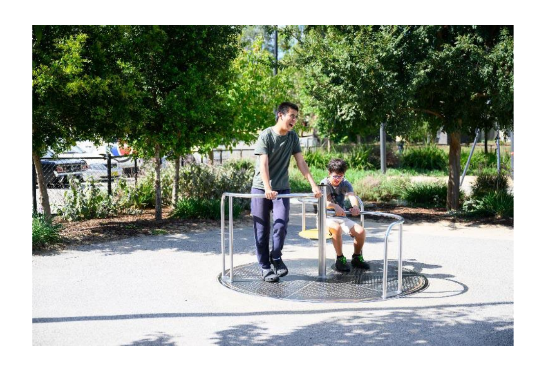
There is a carousel that I can play with.