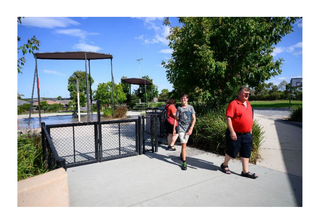
After a busy day, I head home.