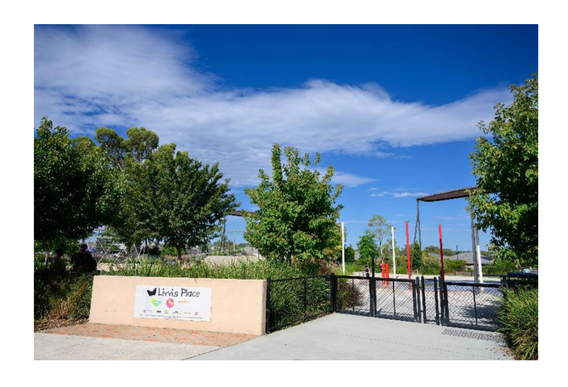
I enter Livvi's Place through the main gate.