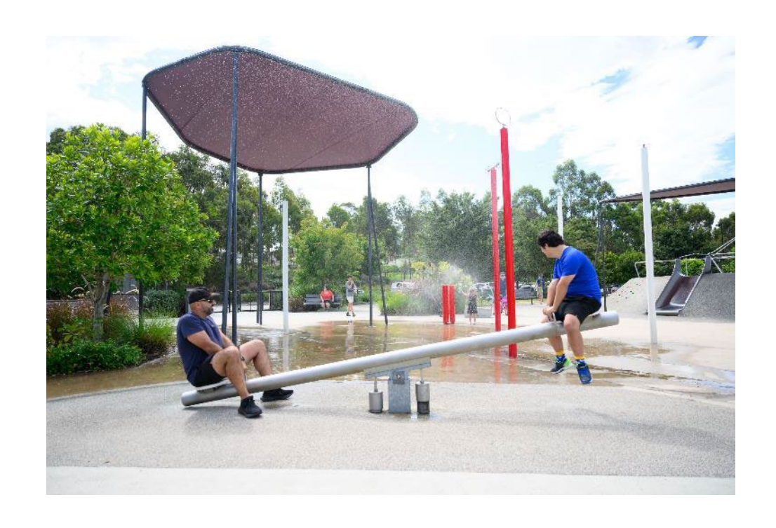
The seesaw turns on the water sprinklers.