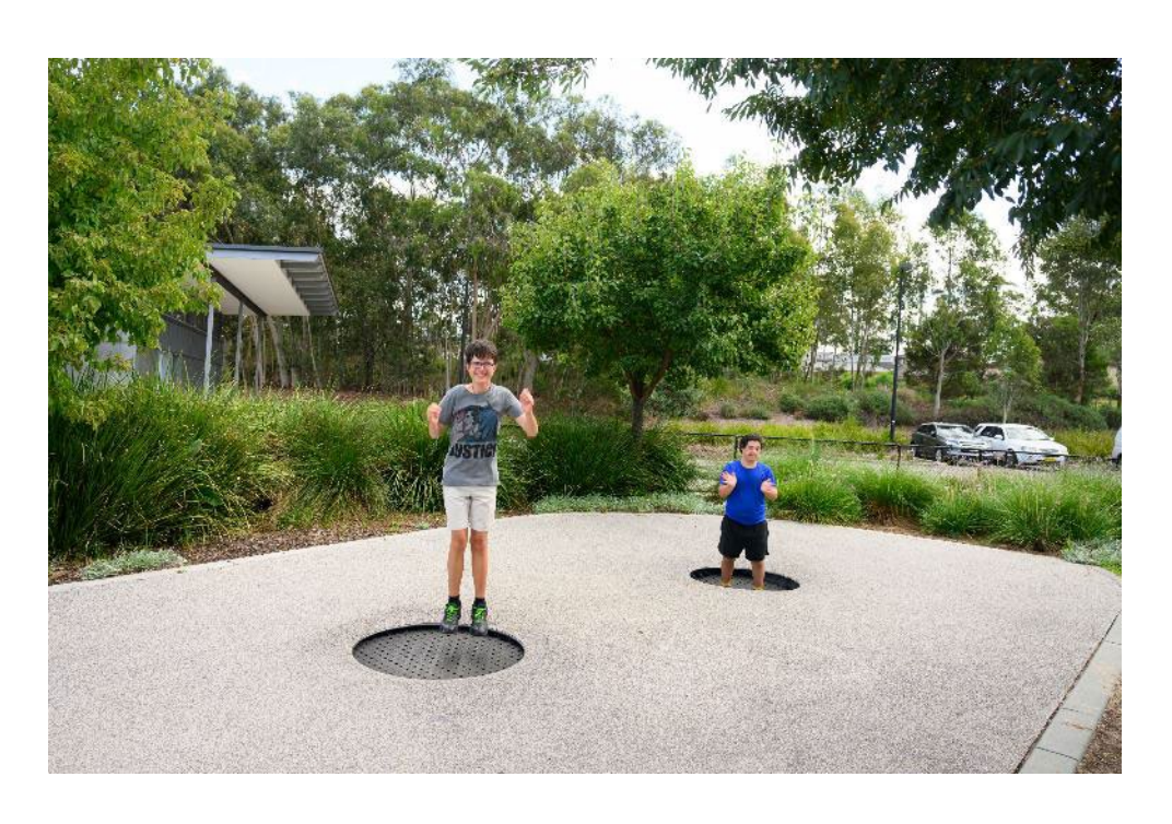
Or jump on the trampolines.