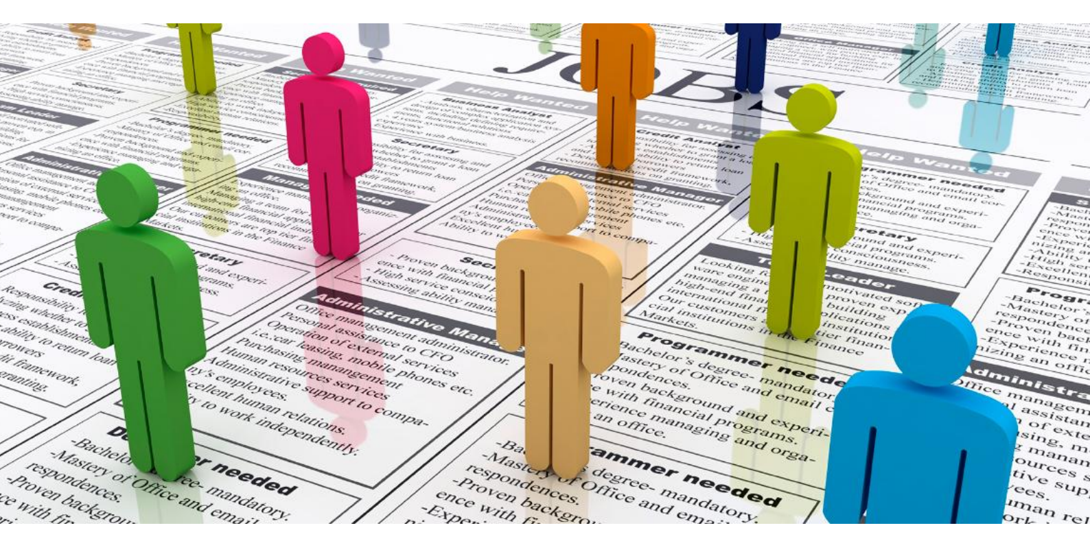
Jobs Close to Home