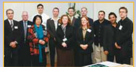
Winners, highly commended and judges at the 2007 Building Design Awards

Redevelopment, Riley Street, Penrith - Project Designer: Bovis Lend Lease (Designer and Builder)