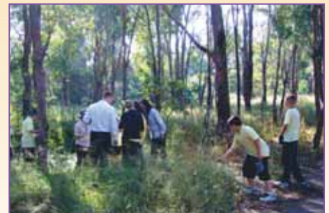
Creek from Victoria Road to the mouth of Werrington Lake. It is funded by a $119,700 grant from the Hawkesbury-Nepean Catchment Management Authority along with further funding from Council's Enhanced Environmental Program.

The Werrington Creek Restoration Project is an extension of the work already being carried out by Penrith City Council and Greening Australia to restore Werrington