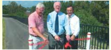
Chairman of the GRW Incorporated Hon Kevin Rozzoli, Mayor of Penrith City Pat Sheehy and Minister for Planning Frank Sartor officially open Stage One of the Great River Walk

The ultimate aim is for the Great River Walk to follow the Hawkesbury Nepean River system south of Goulburn to its mouth at Broken Bay just north of Sydney. The Penrith to Windsor section is the first component of the project along the Nepean River.