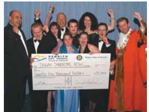
Last year's inaugural Ball raised $25,000 for the Down Syndrome Association of NSW

The 2007 Mayoral Charity Ball is fast approaching once again. This year, one of the biggest social events on the calendar is being held on Saturday 25th August at Panthers World of Entertainment.