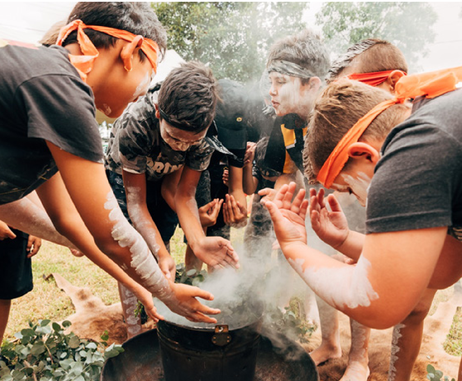
NICE (Nations in Cultural Exchange) project celebration Kingswood Park, February 2021.

Council values the unique status of Aboriginal people as the original owners and custodians of lands and waters, including the land and waters of Penrith City. Council values the unique status of Torres Strait Islander people as the original owners and custodians of the Torres Strait Islands and surrounding waters. We work together for a united Australia and City that respects this land of ours, that values the diversity of Aboriginal and Torres Strait Islander cultural heritage and provides justice and equity for all.